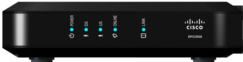
Table 1. Front Panel Features