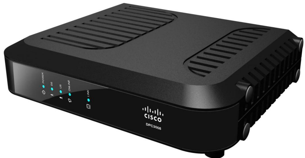
Figure 1. DPC3008 DOCSIS 3.0 8x4 Cable Modem (image may vary from actual product and specification)

The DPC3008 is designed to DOCSIS 3.0 specifications as well as being backward compatible with DOCSIS 2.0, 1.1, and 1.0 networks.